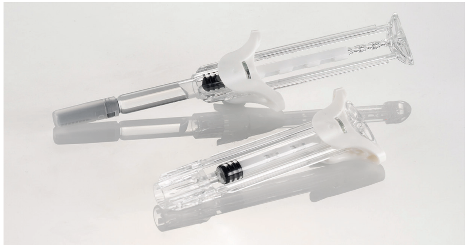
Figure 1: Unisafe™, the springless, passive safety device designed to work with existing, prefillable syringes, avoids disruption to an end-user's treatment routine whilst ensuring that there is no need to change any existing injection components.

The current market place is largely composed of retractable and non-retractable safety syringes which are activated through a spring component. This has previously led to challenges, including accidental activation where a device may activate in transit or accidental under-dosing, where it